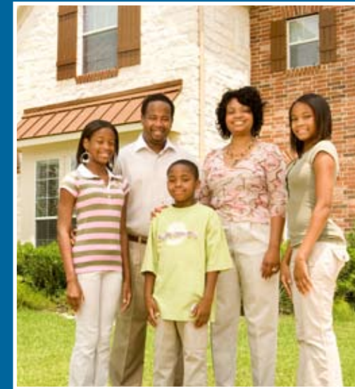
The Viville Family

The developers of River's Edge recently launched a new advertising campaign featuring several families in the community. So, keep an eye out for your neighbors!