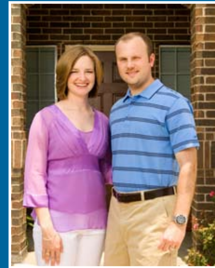
The Morales Family